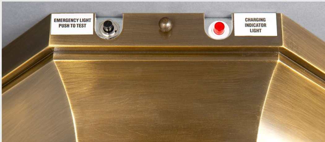
AD32786-15 Yorkville EM fixture is shown in Satin Brass "A" on Aluminum with White Acrylic Bottom Diffuser