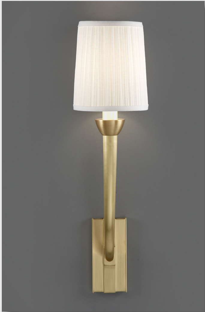
CC31431 Rennes is shown in Satin Brass with White Shirred Shade